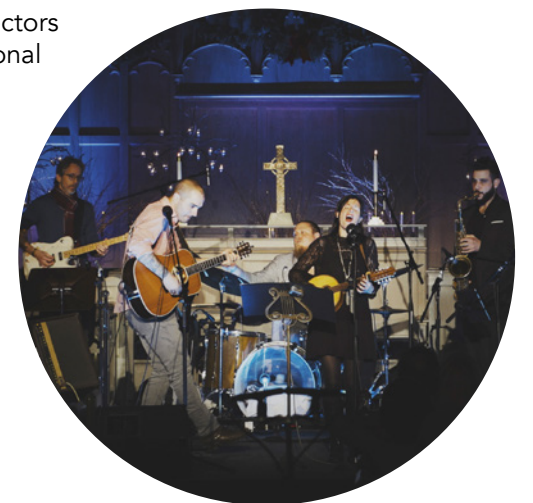
Benefit Christmas Concert

NPC's Hearts for Justice and Mercy Committee seeks to fulfill God's commission in Micah 6:8 to act justly and to love mercy and walk humbly with Him. To this end, we support members of our congregation who are already engaged in these ministries, inspire and disciple those seeking to find their niche, and encourage congregants to learn and pray for both the giver and recipients of our work. Areas of service include Quilts for Comfort, Philadelphia Service to the Homeless, Anti-Human Trafficking, Orphan Care, and Race Relations.