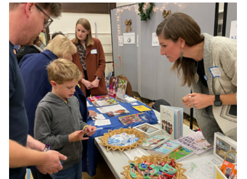
Gifts of Hope

Narberth Presbyterian Church has a serious commitment to missions. As a church, we contribute more than 20% of our overall budget to support career missionaries, members and friends on short-term mission trips, mission agencies actively sharing the Gospel, and ministries of care, justice and mercy. We have 37 mission causes found locally and around the world. This level of commitment is our response to "the Great Commission" of going into all the world to preach the Gospel. We raise awareness of missions through weekly bulletin updates and a yearly alternative gift market called Gifts of Hope which brings our entire congregation together along with representatives of dozens of our mission causes for education, support, and financial giving. Learn more about Gifts of Hope here .