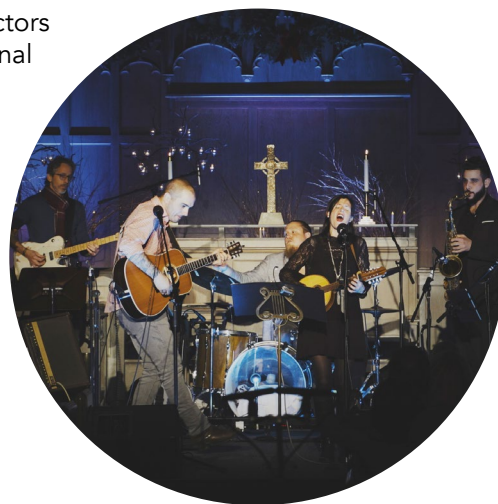
Benefit Christmas Concert

NPC's Hearts for Justice and Mercy Committee seeks to fulfill God's commission in Micah 6:8 to act justly and to love mercy and walk humbly with Him. To this end, we support members of our congregation who are already engaged in these ministries, inspire and disciple those seeking to find their niche, and encourage congregants to learn and pray for both the giver and recipients of our work. Areas of service include Quilts for Comfort, Philadelphia Service to the Homeless, Anti-Human Trafficking, Orphan Care, and Race Relations.